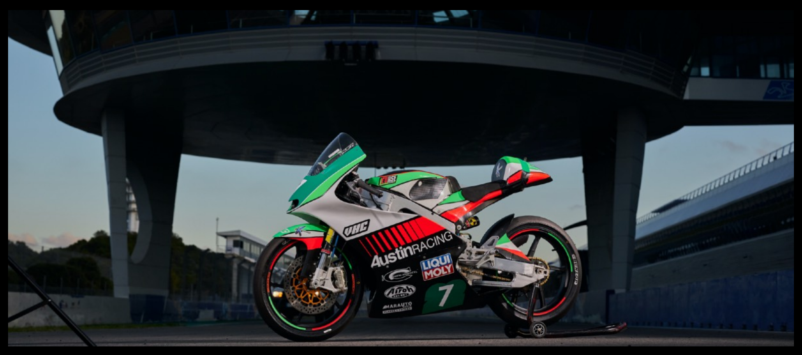
Beñat Fernandez: "It has been an exciting race. I have a very good feeling on the bike and I was able to manage my last lap very well. It was not an easy race but I am very happy with the win!"